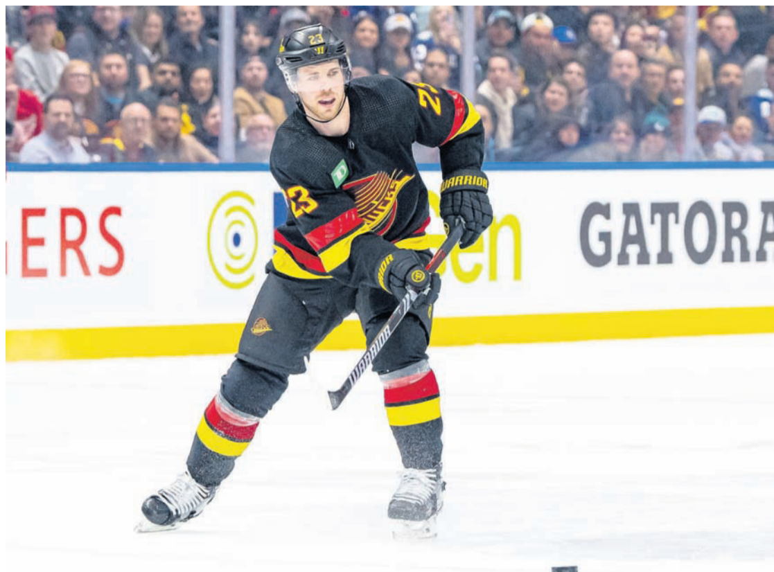
Vancouver Canucks' Elias Lindholm passes the puck during the third period of the team's NHL hockey game against the Detroit Red Wings on Thursday, Feb. 15, 2024, in Vancouver, British Columbia.

"The West is really tight," said Nathan MacKinnon,